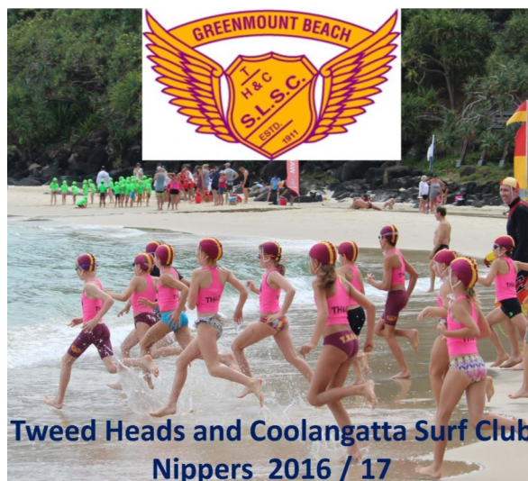
Tweed Heads and Coolangatta Surf Club Nippers 2016 / 17

FAMILY CLUB SAFE SHELTERED BAY SUPER BANK WORLD CHAMPION COACHES LOADS OF PARKING FREE UNIFORM RENOVATED CLUB LOADS OF TRAINING OPTIONS FREE CARNIVALS CAFÉ PRECINCT PARENT SOCIAL EVENTS CHRISTMAS AND BREAKUP PARTIES WATER SLIDES NEW BOARDS SURF SAFETY HUGE CLEAN BEACH SAVE DOLLARS