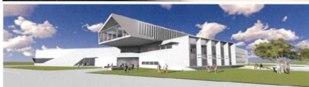
Figure 1 - A 3D perspective of the proposed concept design