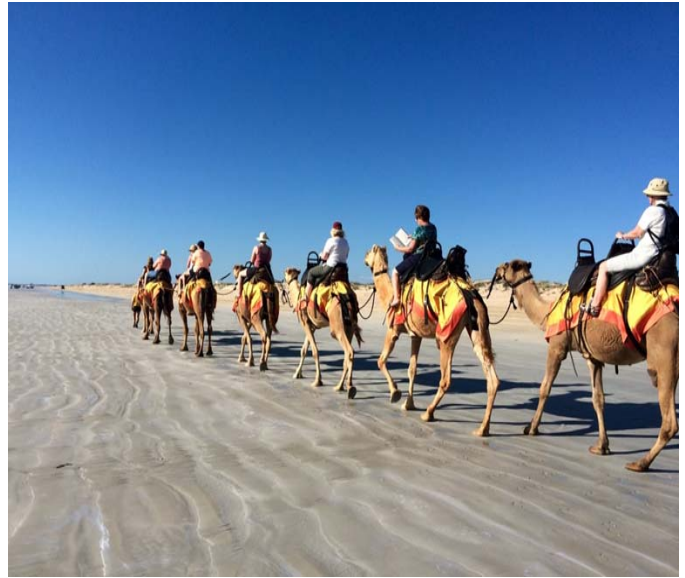
Can you name the English teacher who is reading a book when riding on a camel?